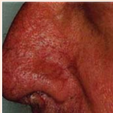
After one treatment