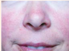
After one treatment